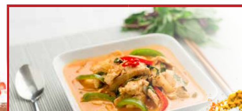
Easy Spice Blends and Homemade Bases for Curry