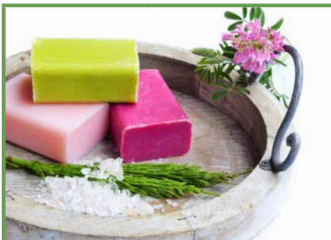
Basic Soap Making Workshop