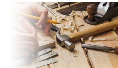
Woodwork - Beginners