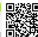
Vietnamese Street Food