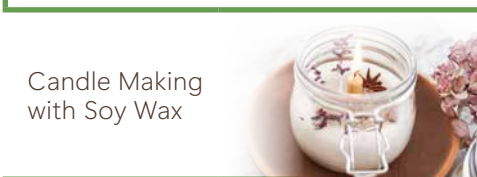
Candle Making with Soy Wax