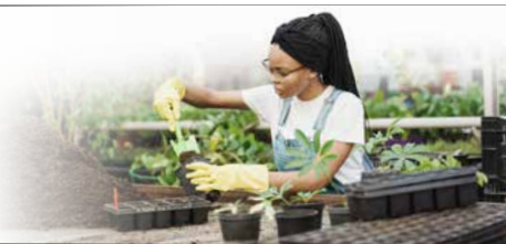
Solid Shampoo and Conditioner Bars