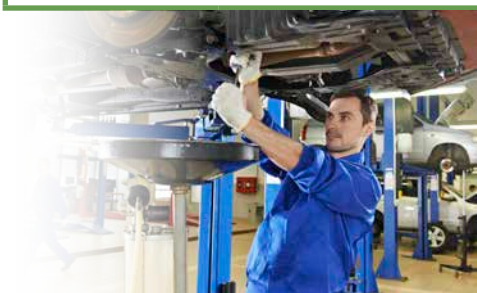
Basic Car Maintenance